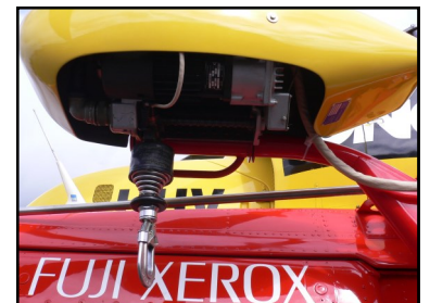
*Stock photos of modifications

AIRWORK (NZ) LIMITED 487 Airfield Road, Ardmore, Auckland PO Box 72516, Papakura, Auckland 2244, New Zealand 850@airwork.co.nz Tel: + 64 9 295 2100 Fax: + 64 9 295 2101